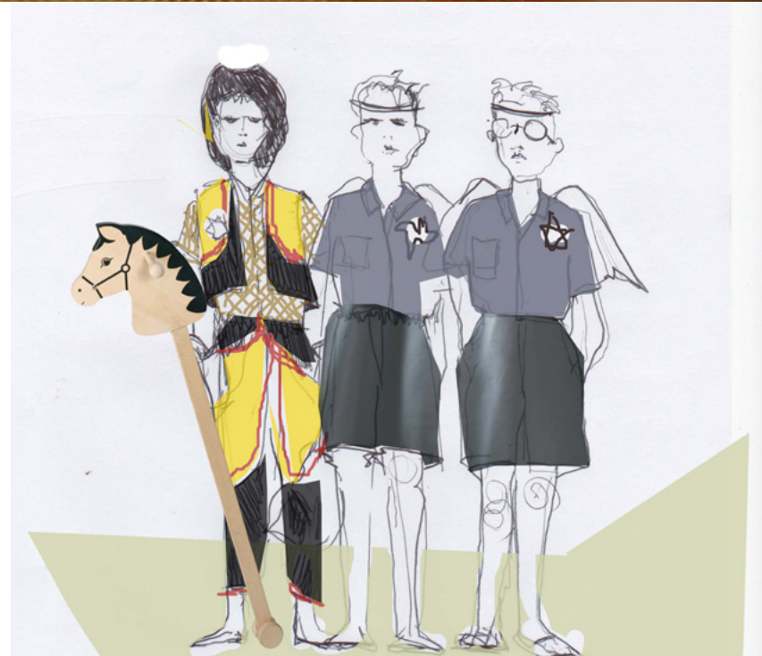
The Three Boys costume sketch by Dale Ferguson

The music is also full of lively dance rhythms of Mozart's time. Some are from the formal dance styles of the nobility, used in connection with the noble characters and ideas. Others are simple and cheerful, suggesting more casual circumstances and characters. There are also more serious styles of music, like the fast, virtuoso lines for the evil Queen of the Night; the moving, poignant music for the royal lovers Pamina and Tamino; and dramatic orchestral interludes. Mozart wrote for the orchestra in unique ways, emphasizing instruments that heighten the dramatic and supernatural